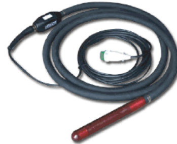
VAF36 - VAF60-1